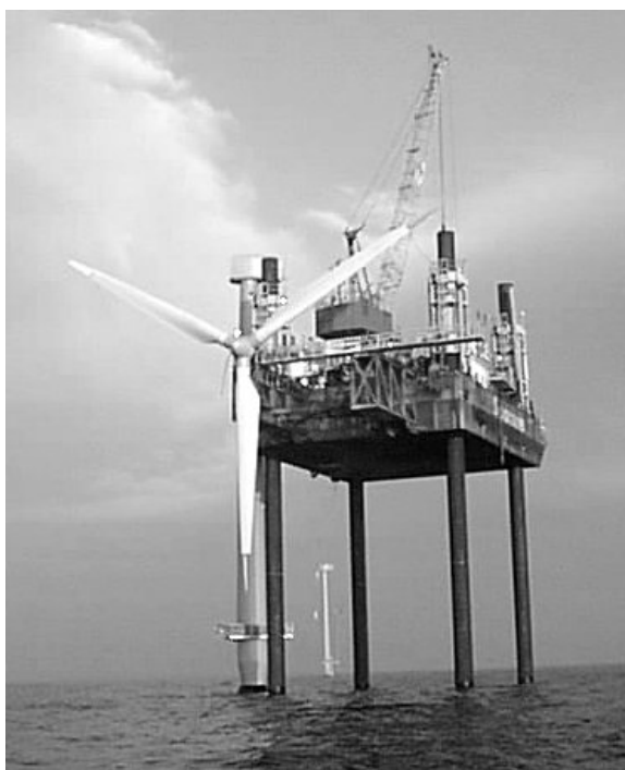
Figure 4: SEACORE jack up barge used for drilling and erection

It turns out that a substantial cost reduction compared to the wind farms Vindeby and Tunø Knob could be achieved which were about 80% and 50% more expensive than Bockstigen. A favourable location on land is now only about 15-20% cheaper than the offshore installation at Bockstigen.