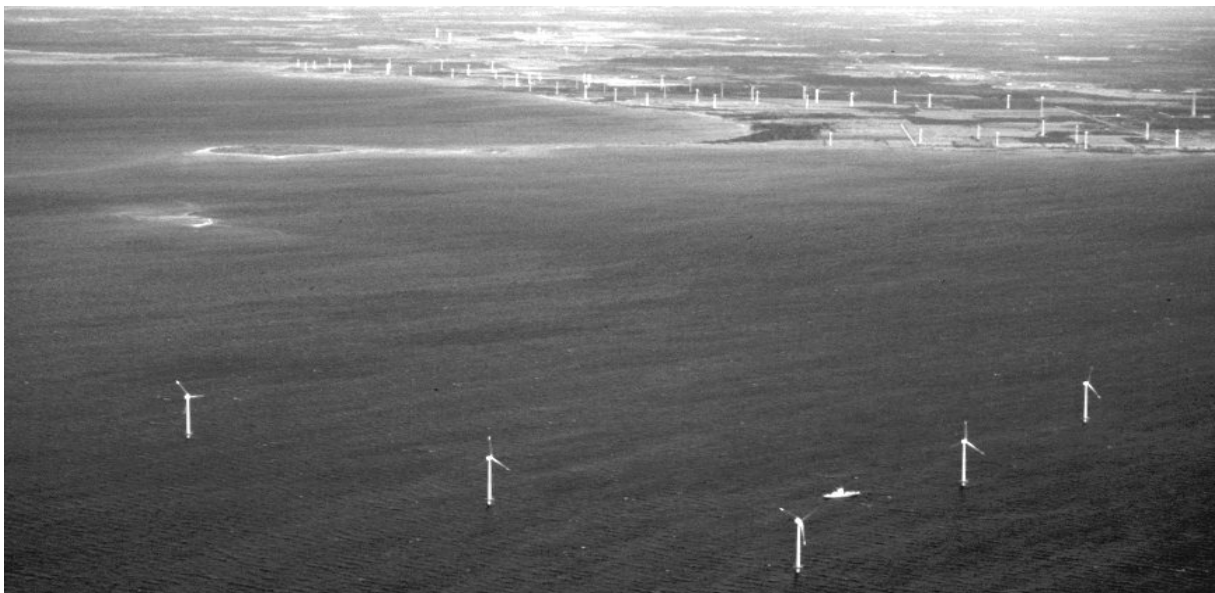
Figure 1: Bockstigen wind farm