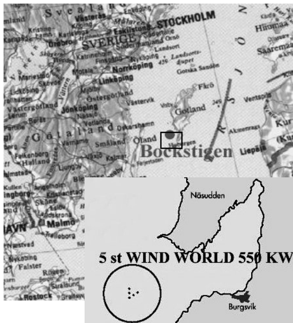
Figure 2: Site and layout of the wind farm Bockstigen